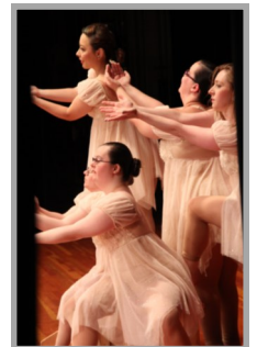
"Poetry in Motion"